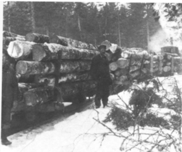
A typical log hauler crew consisted of an engineer, fireman, conductor, and the steerer. The conductor, riding close to the rear, communicated with the cab by a bell rope which ran along the sled stakes.

The first Lombard gasoline engine machine was built in 1909 by Lom-