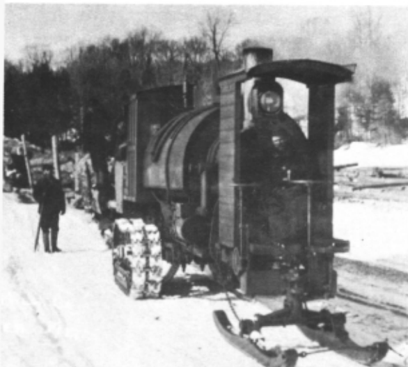
There were no brakes on a log hauler or on its train of sleds...nearly every road had its downgrade that made steerers pray that should they live this once more then they would find some other way to make a living."—Yankee Magazine, March 1965.

One of the very few of the steam engines that were preserved has been restored to its original running condition and is on exhibition in the Patten, Maine, Lumberman's Museum.