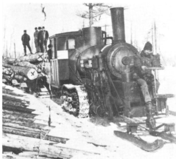
A Peavey Log Hauler, Traction was obtained by revolving screws.

The description, claims and drawings of this patent are restricted to the