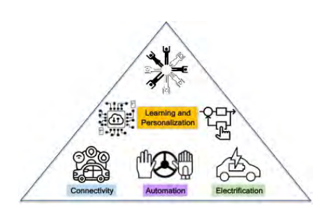
Figure 1: Illustration of humancentric vehicle automation and control.