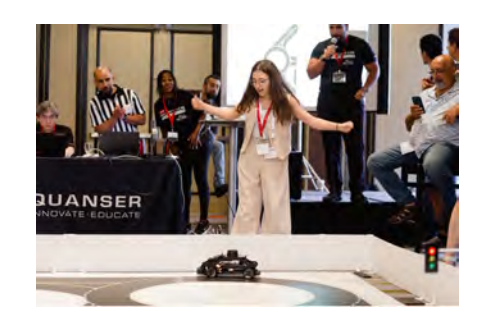
Figure 2: Self-driving car student competition.

The American Control Conference was held in Toronto, Ontario, Canada on July 8-12, 2024 at the Westin Harbour Castle. The purpose of this annual conference is to bring together researchers and practitioners in the controls community to share their ideas and findings. Engagement of students and young professionals was a priority for the conference, including a student networking session, several special sessions, and the selfdriving car student competition by Quanser. The operating committee was also assisted by the Student Advisory Committee in organizing the conference. In total there were 1363 registrants at the conference, including 415 students. There were 46 countries represented at the conference.