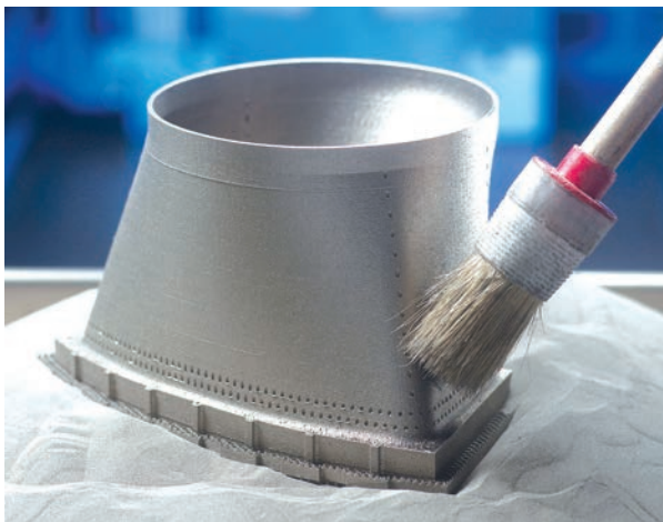
Manufacturing a short pipe section with a smooth transition from round to square is simplified by use of 3-D printing.

Meanwhile, other gas turbine manufacturers are making use of advanced methods. Rolls-Royce announced in 2015 that it will conduct flight tests on the largest 3-D printed component to ever power an aircraft—a titanium housing that contains 48 airfoils. The component is 1.5 m in diameter and 0.5 m in thickness. And recently, Toulouse-based Safran Microturbo